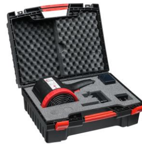
Standard Carrying Case